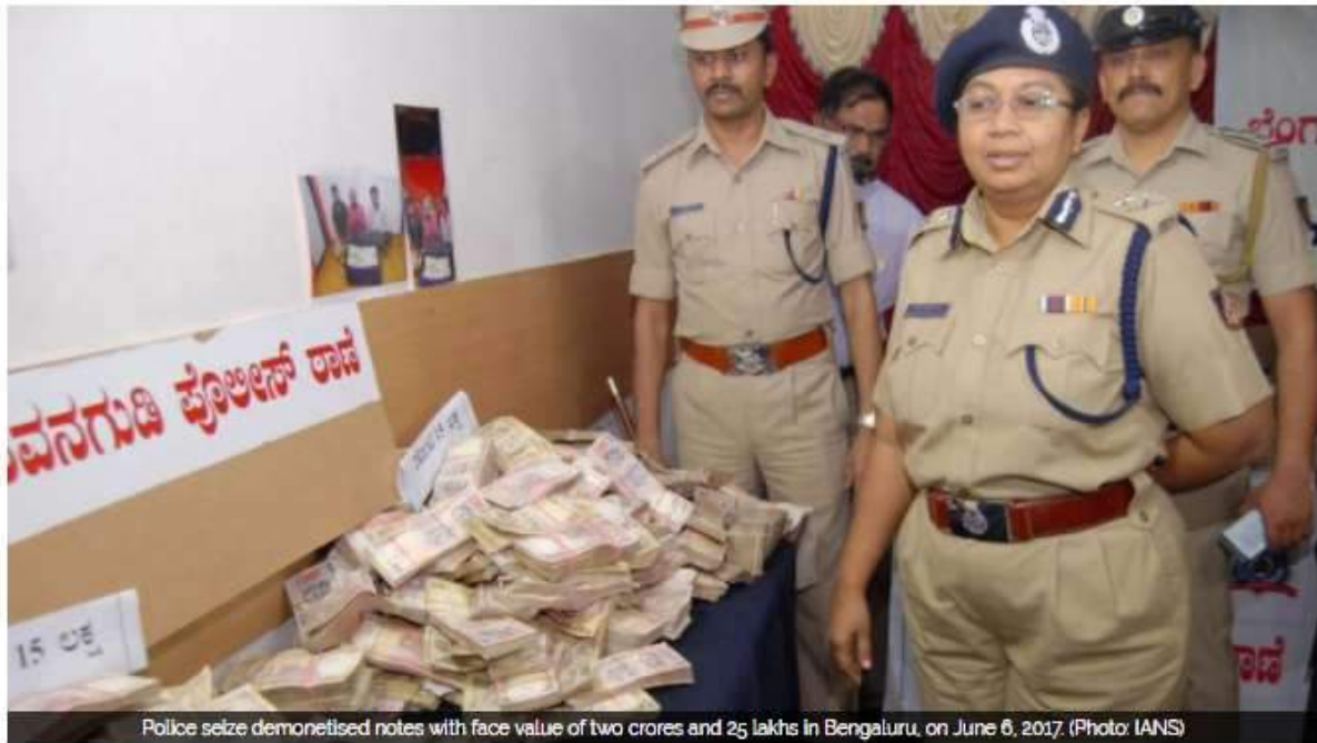
Police seize demonetised notes with face value of two crores and 25 lakhs in Bengaluru, on June 6, 2017.