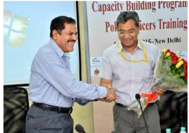
Police officers attending training in New Delhi

The Police department is the primary law enforcement agency. It administers the Government's economic, trade and tariff policies, handles international traffic of imports & exports, and aids to minimize demerit goods from augmenting in the markets. FICCI CASCADE organized a training programme for the Delhi Police officers on August 03, 2015 at the Rajender Nagar Police Station, New Delhi, with an objective of equipping the police officers to understand and take requisite action against counterfeiters and smugglers.