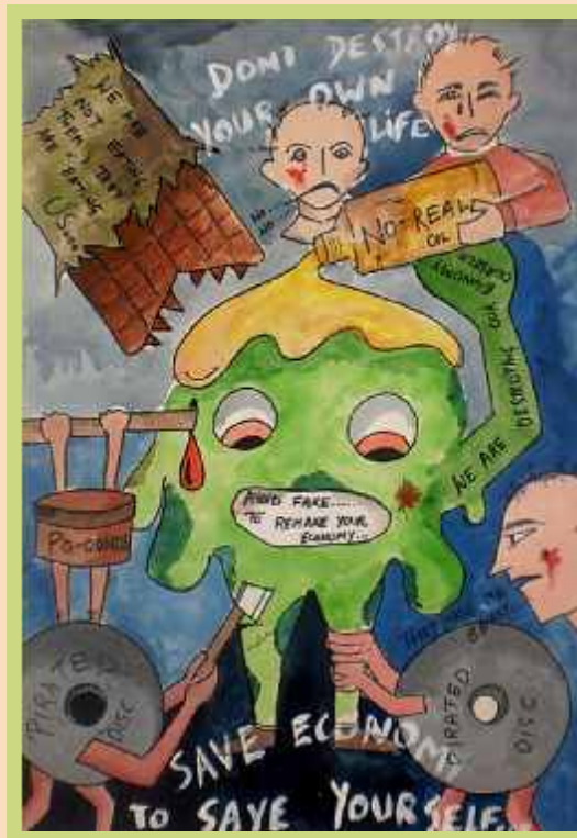
Illustration by a participant in the FICCI CASCADE Facebook Art Competition on Fake and Smuggled Goods