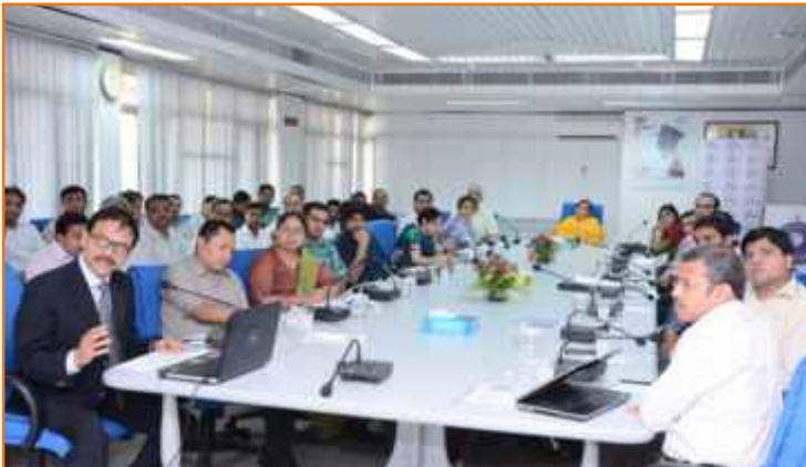
Customs Training Programme in session

Representatives of Dow Corning, Puma and Burberry gave presentations and exhibited samples of their original products alongside their counterfeit copies. The objective was to highlight the key technical aspects of their products which could facilitate the detection of counterfeit products. The participating Customs officials found the presentations constructive and interacted actively both with the company representatives as well as among themselves. It was decided that an additional training session would be organized by FICCI CASCADE for another batch of Customs officers, in July 2014.