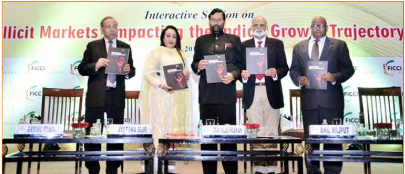
Officials during the Launch of FICCI CASCADE Reports on Illicit Markets - A Threat to Our National Interests