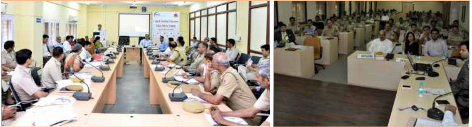
Police officers attending training in New Delhi and Pune

1 April, 2015, New Delhi and 27 February 2015, Pune