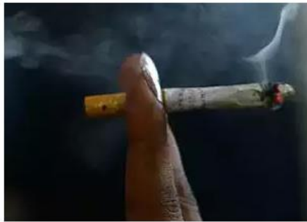
The number of incidents of smuggling of cigarettes and tobacco products increased to to 3,108 cases in 2016-17.

NEW DELHI: Incidents of cigarettes and tobacco products smuggling in India increased by 136 per cent in 2016-17 from 2014-15, according to a report by FICCI CASCADE.