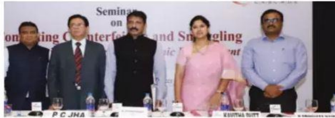
चेन्नई में मंगलवार को आयोजित सेमिनार में उपस्थित वक्ता।

चेन्नई, फिक्की कास्केड (कमेटी अगेन्स्ट स्मगलिंग एंड काउंटरफ्रीटिंग एक्टिविटीज डेट्राइंग द इकोनोमी) की ओर से सेमिनार का आयोजन किया गया। इस सेमिनार में नकल एवं तस्करी से निपटने के उपायों पर चर्चा की गई। सेमिनार ने वक्ताओं ने माना कि आर्थिक विकास को तेज करने के लिए यह अनिवार्य है। सेमिनार में