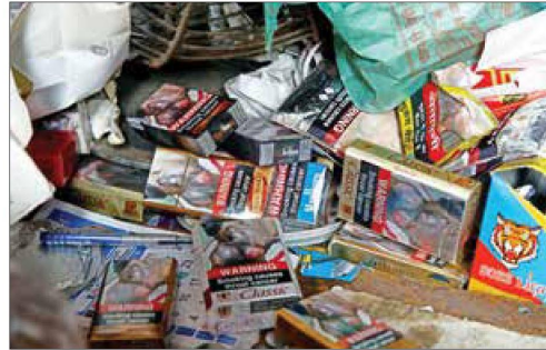
It is important to lower the detrimental impact of illicit trade on the financial, industrial, and societal health of our country

Over the years, FICCI CASCADE has been encouraged by the support of several international organisations which have worked assiduously in addressing this issue at the global level, and this eventually led to the emergence of MASCRAD (Movement Against Smuggled and Counterfeit Trade) in 2013. Since its inception, institutions such as WIPO, UNODC, Interpol, OECD, WCO, UKIPO, USPTO, US Department of Homeland Security, JETRO,