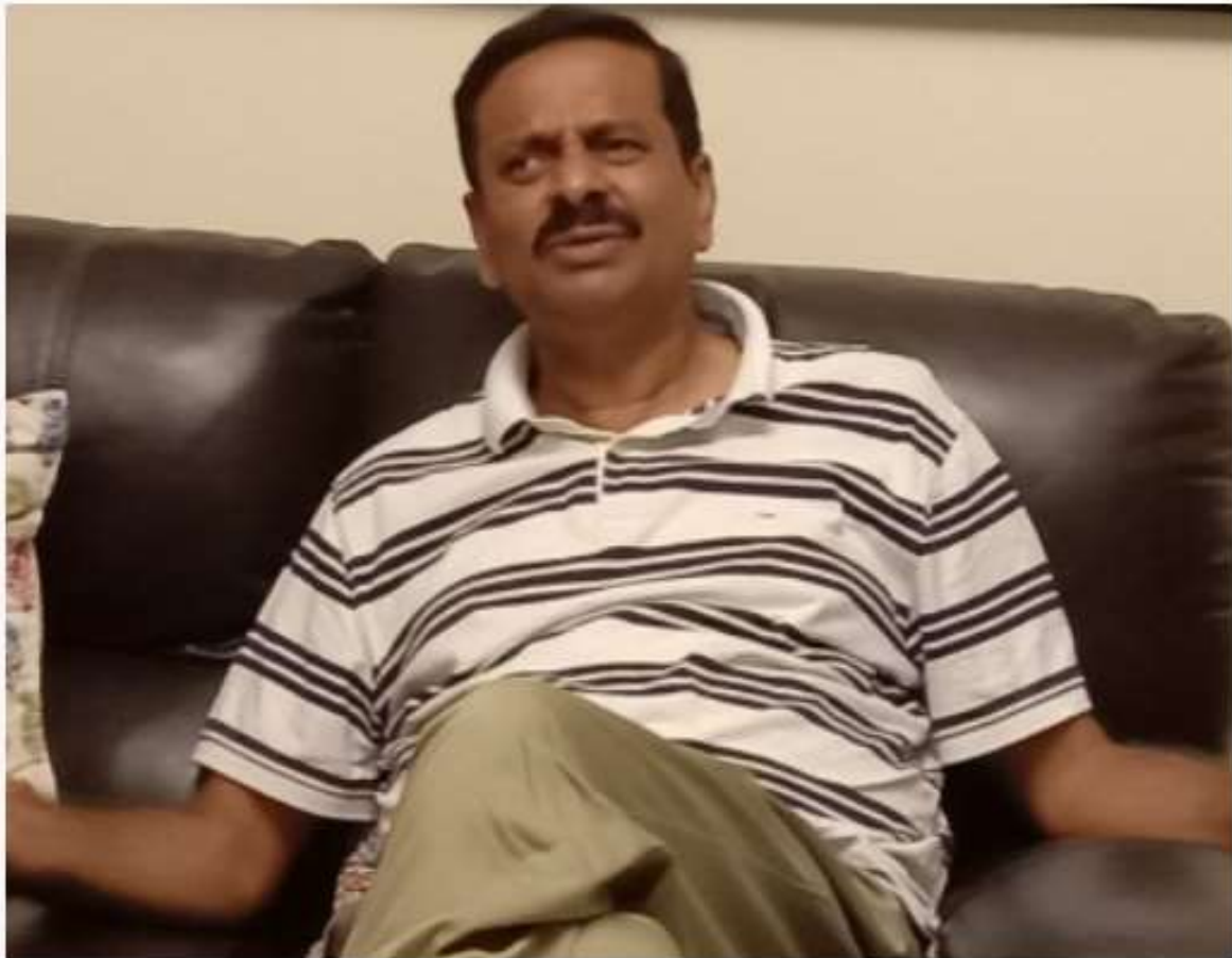
J&K govt to give priority to check smuggling, counterfeiting