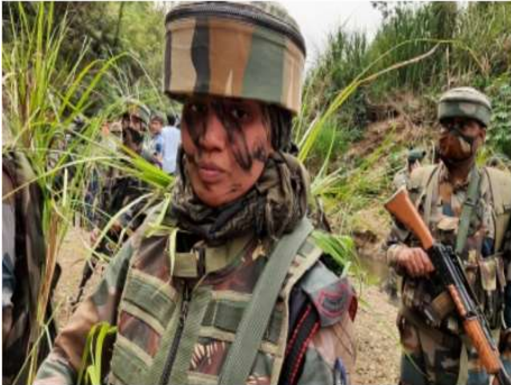
Assam Rifles seized contraband worth Rs 1,603 cr since 2020