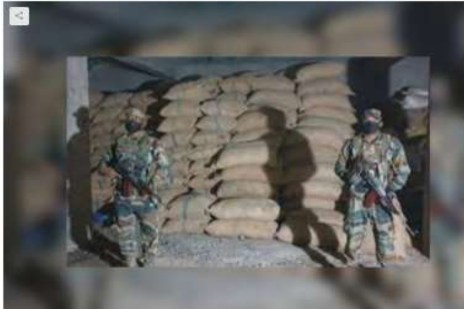
Seized illegal goods worth Rs 1,600cr in North East