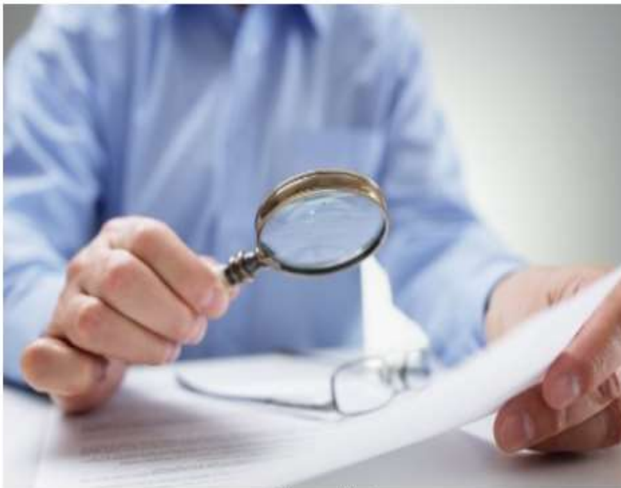
Representative image.

PTI, AUG 18 2021, 15:33 IST | UPDATED: AUG 18 2021, 15:33 IST