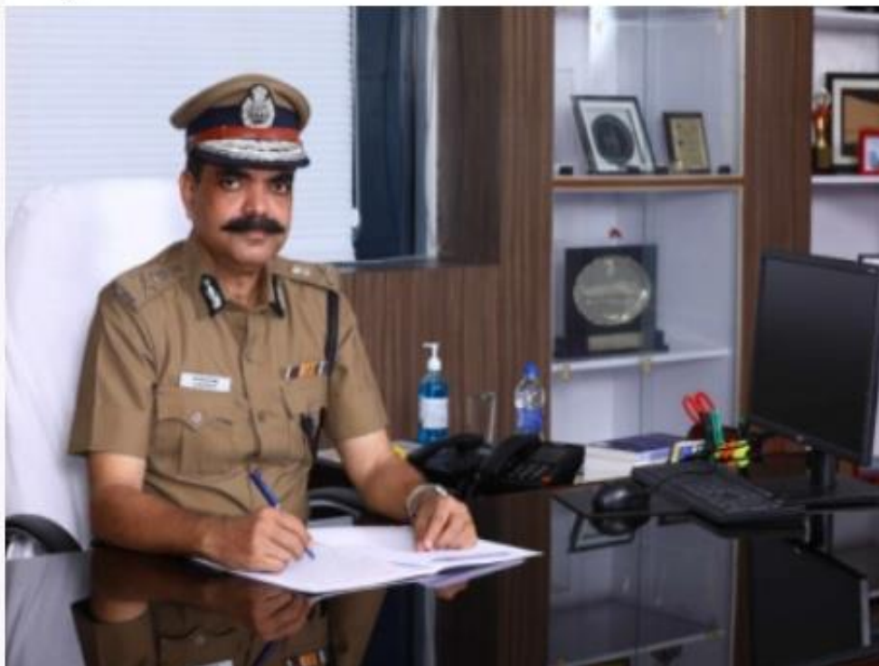
'Need for specialised training to understand intricacies of smuggling, counterfeiting'