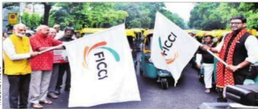
An auto-rickshaw rally being flagged off in New Delhi on Saturday.