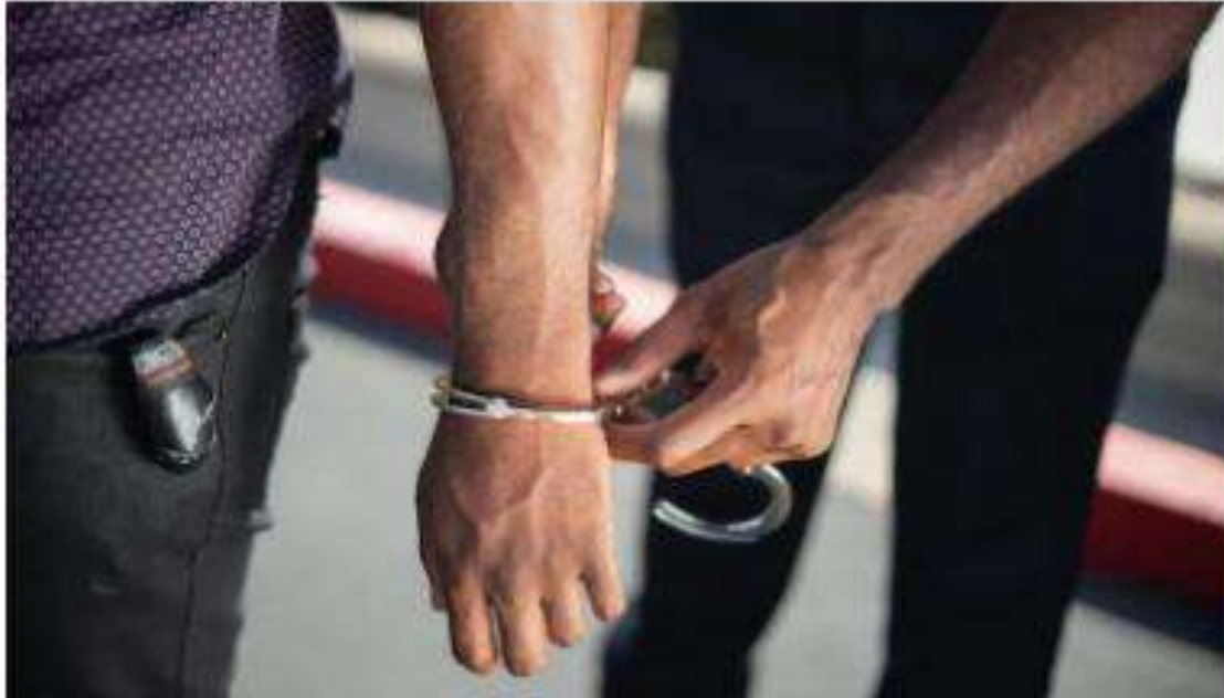
#BeACASCADER targets smuggling and tax losses