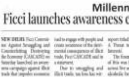
Millennium Post Ficci launches awareness campaign against smuggling