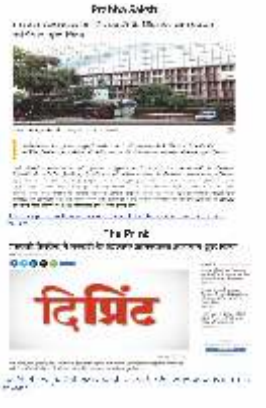
अर्थी, जलसानी के खिलाफ किसानों की आंदोलन