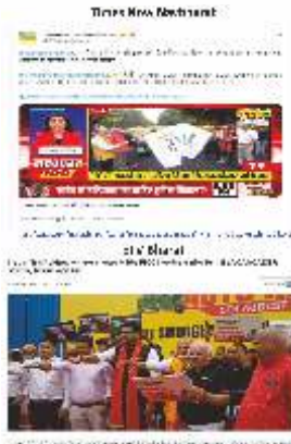
अर्थी, जलसानी के खिलाफ किसानों की आंदोलन