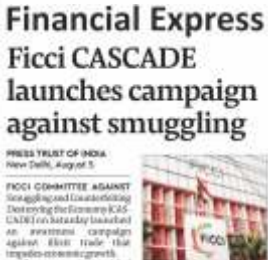
Ficci launches awareness campaign against smuggling