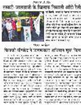
अर्थी, जलसानी के खिलाफ किसानों की आंदोलन