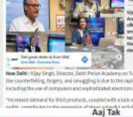
Sophisticated electronic devices reason for rise in counterfeiting, forgery