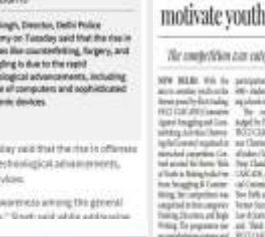
FICCI CASCADER holds inter-school competition to motivate youth for making India free from illicit trade