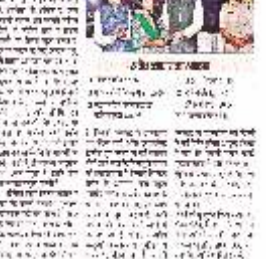
अर्थी, जलसानी के खिलाफ किसानों की आंदोलन