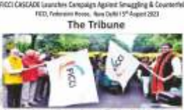
Ficci CASCADER launches campaign against smuggling