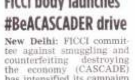
Deccan Chronicle FICCI body launches #BeACASCADER drive