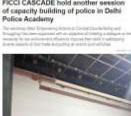
Ficci CASCADER hold another session of capacity building of police in Delhi Police Academy

Prabhat Khobar नकली सामानों पर नकल के लिए जरूरत पड़ी, तो चलना विशेष अभियान - डीजीपी का कहना है। नकली सामानों पर नकल के लिए जरूरत पड़ी, तो चलना विशेष अभियान - डीजीपी का कहना है।