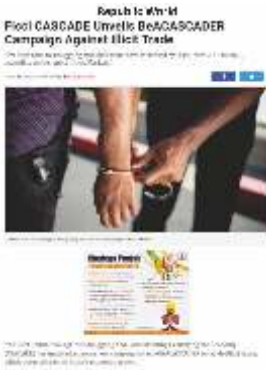
Ficci CASCADER Unveils Campaign Against Illicit Trade