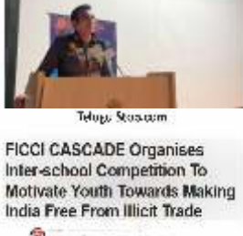
Ficci CASCADER Organises Inter-school Competition To Motivate Youth Towards Making India Free From Illicit Trade