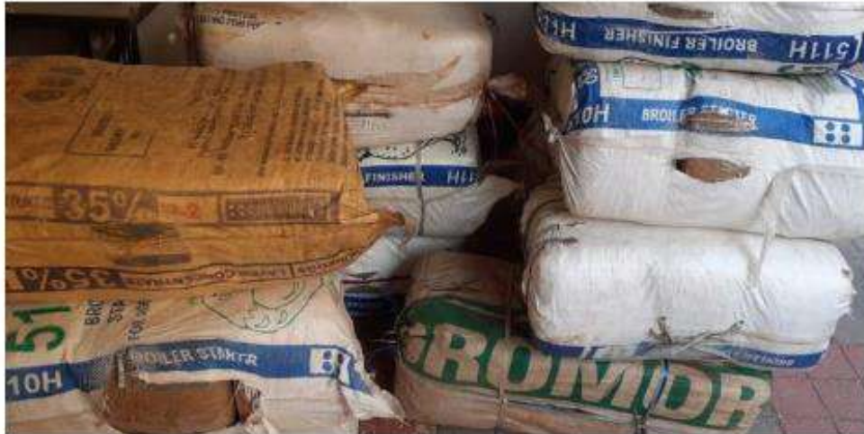
DRI seizes contraband worth Rs 35 crore