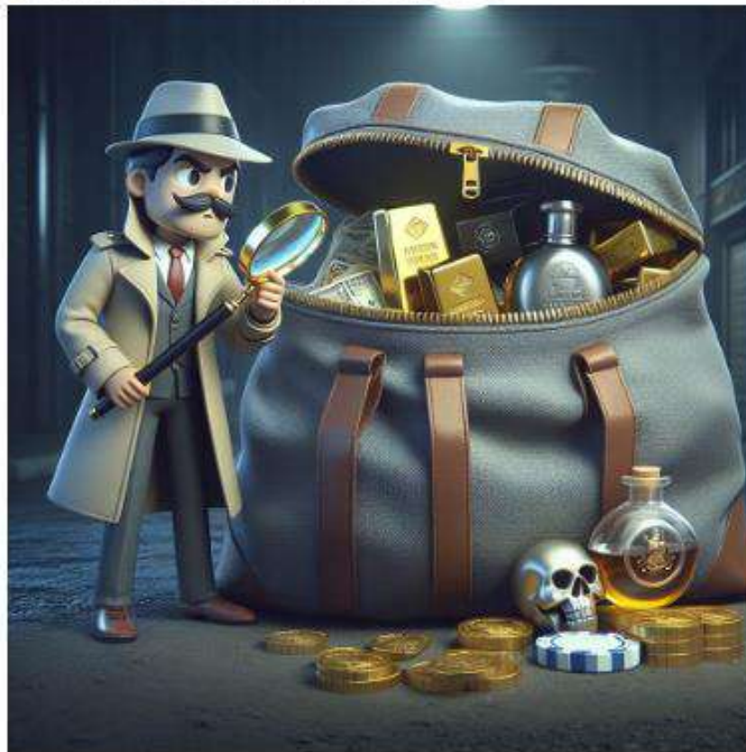
AI Generated Representative Image

PTI | New Delhi | Updated: 20-06-2024 12:25 IST | Created: 20-06-2024 12:25 IST