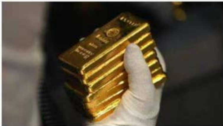
Cases of gold smuggling have been on the rise to subvert the 15 per cent duty amid a sharp rise in gold prices.